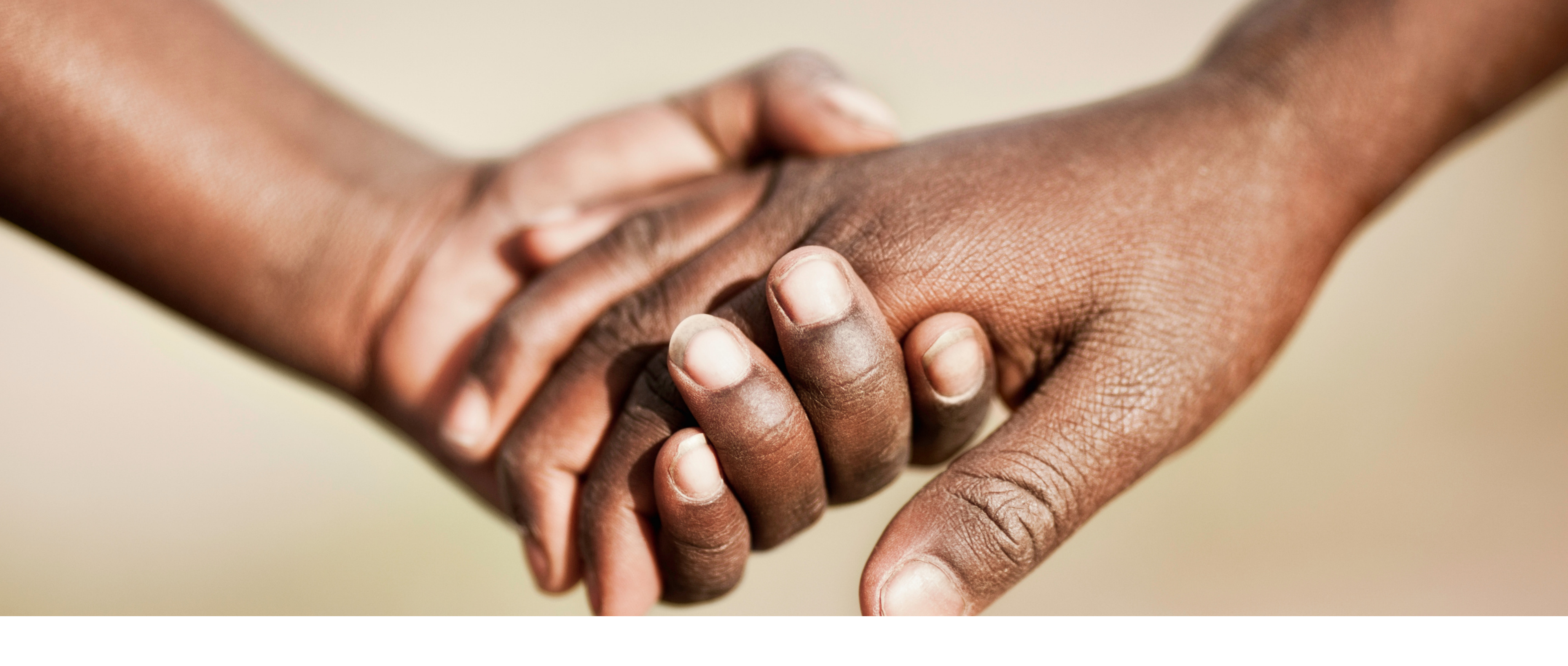
Inclusivity in Childcare: More Than Just A Buzzword